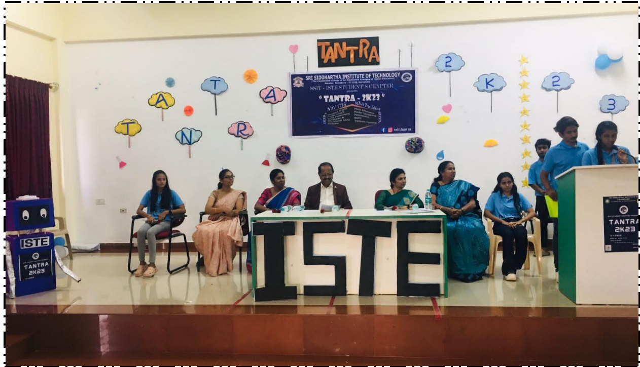
Dignitaries of SSIT – ISTE SB “TANTA – 2K23”