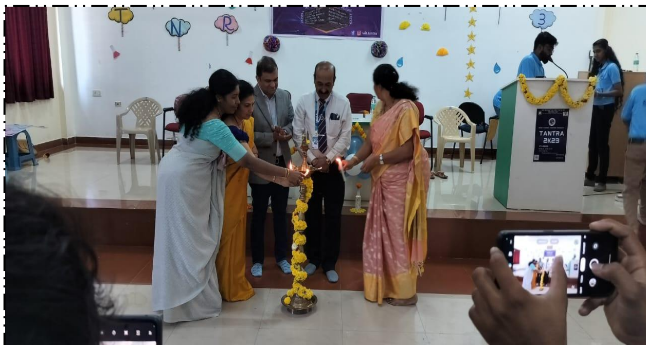
Inauguration of TANTRA - 2K23