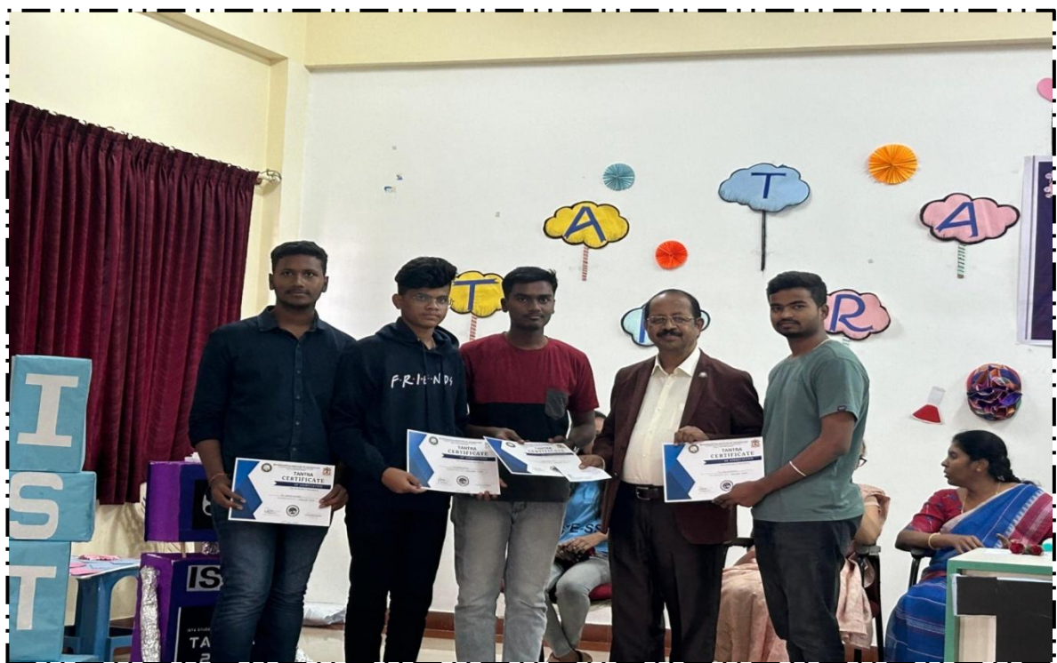
Prize Distribution to Winners and Runner ups