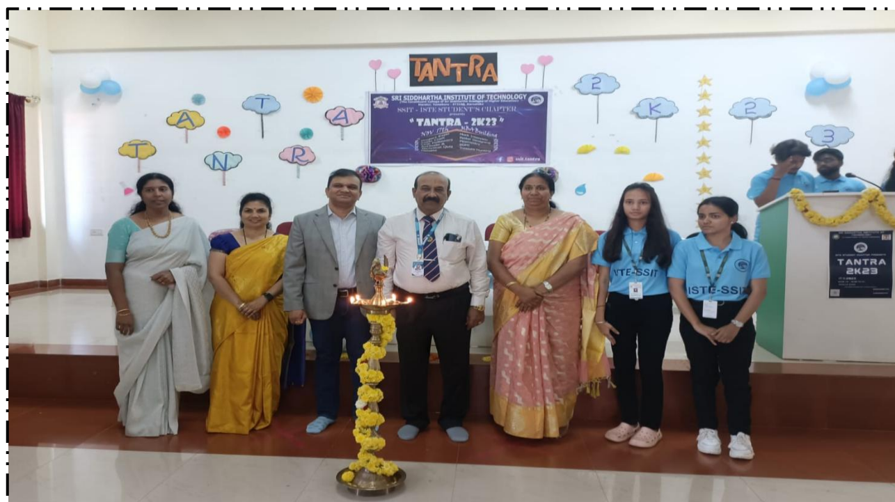
Dignitaries of SSIT – ISTE SB “TANTA – 2K23”