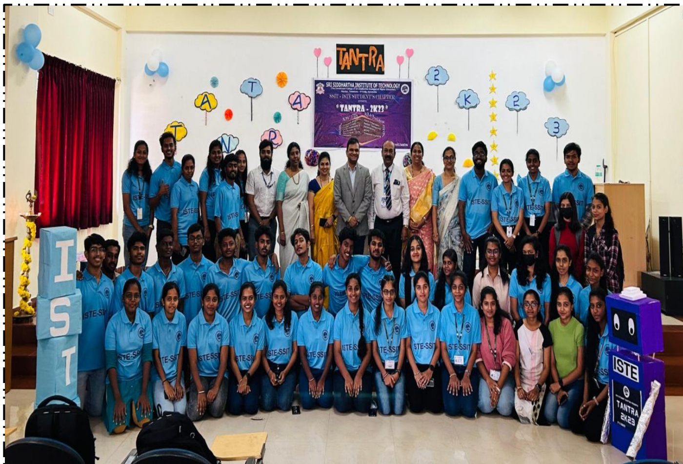
Dignitaries, Coordinators, Volunteers of SSIT- ISTE Student's Chapter Presents TANTRA – 2K23