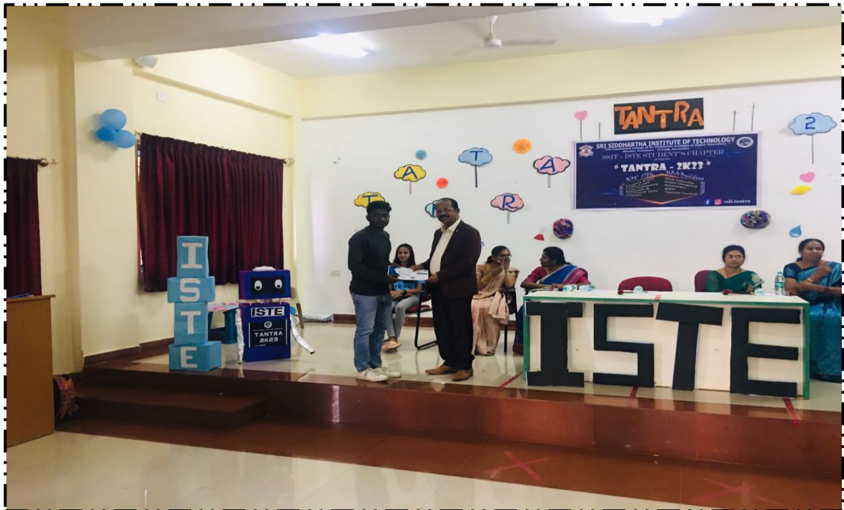
Prize Distribution to Winners and Runner ups